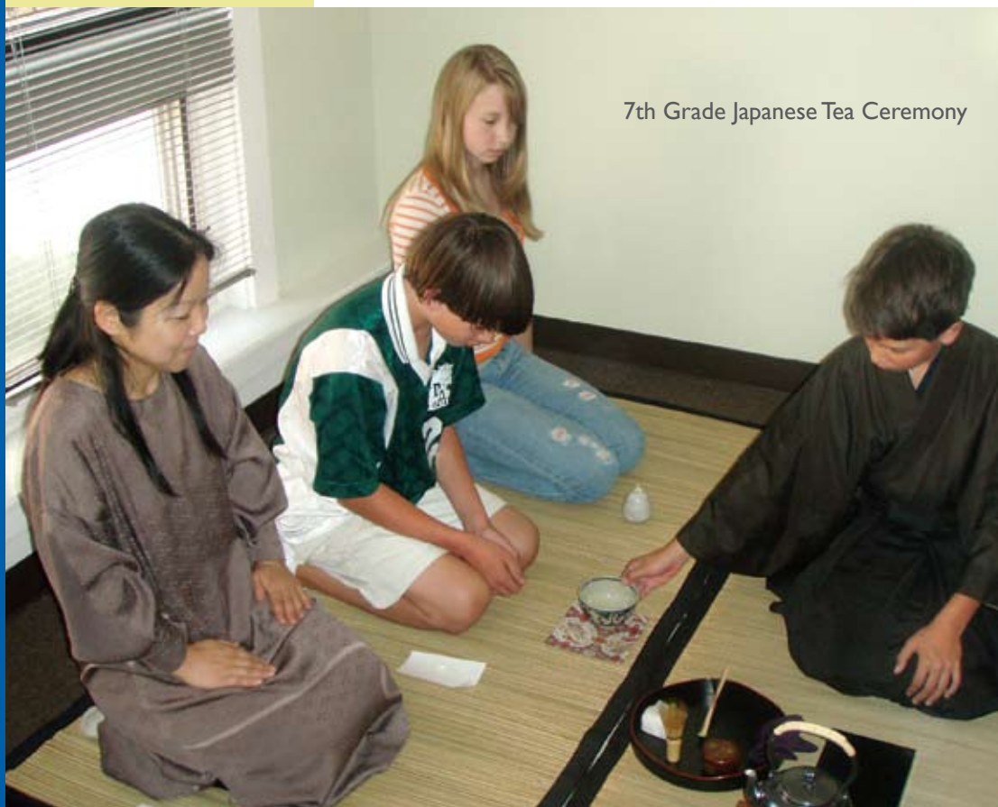
7th Grade Japanese Tea Ceremony

shape individual perspective while celebrating the individual's contribution in shaping the culture. Second, we emphasize the importance of citizenship and community service. Third, we recognize the interconnectedness of all living things. Fourth, we affirm the need for environmental sustainability.